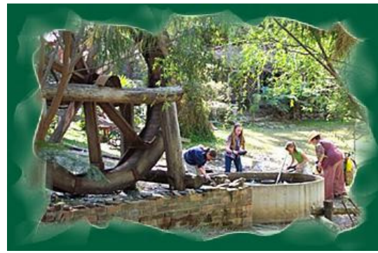
Panning for Gold at Old Mogo Town