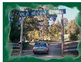
All are Welcome!