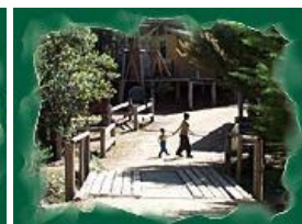
Time Warp Bridge

Open seven days a week with four informative guided tours each day.