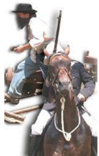
Bushrangers NSW

Although Batemans Bay is by far the largest town on the South Coast's Clyde River this was not always the case, with Nelligen having the first Post Office in 1858 - there was no official Post Office building in Batemans Bay until 1894. It wasn't until the early 1900s that the population of Batemans Bay overtook that of Nelligen.