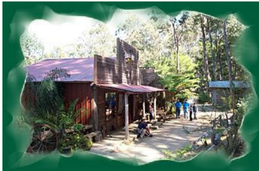
Explore Historical Buildings

Come for a day tour, stay overnight or enjoy a unique family or group holiday with bush cabin accommodation on-site at Old Mogo Town Gold Rush Theme Park on the South Coast of NSW Australia.