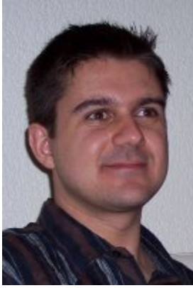
Nando de Freitas